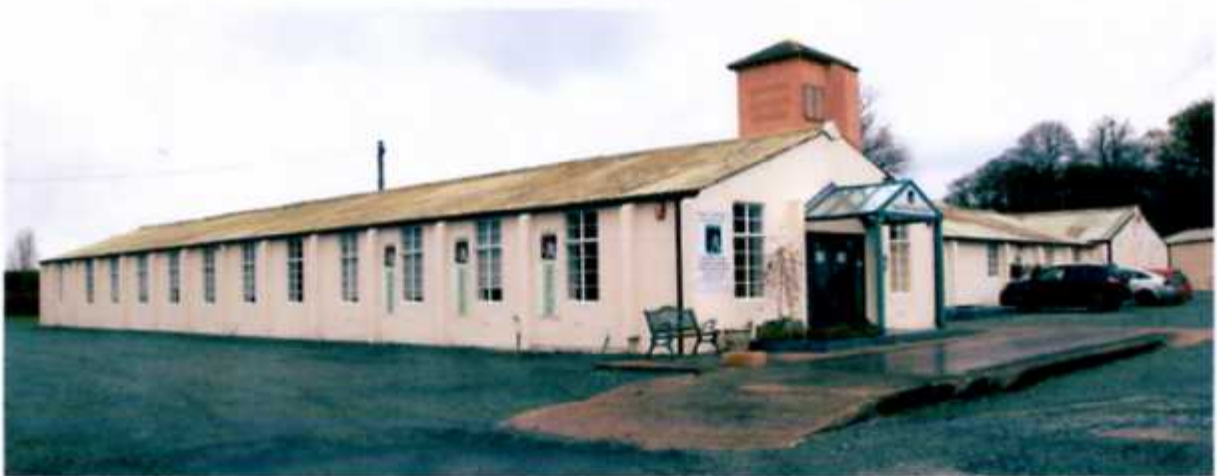
Plate 2: Sergeants' mess on South Communal Site 25-11-11

This plan shows the locations of all of the dispersed domestic sites which were all built north of No.2 School of Technical Training. Only one building is known to be extant