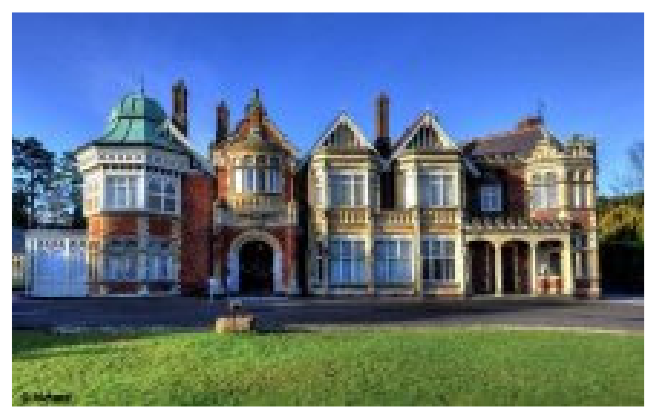
Bletchley Park Mansion