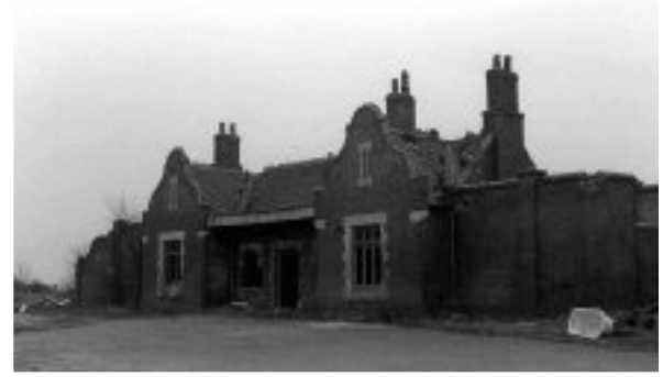
Godmanchester Station closed to passengers 15/June/1959

http://www.disused-stations.org.uk/g/godmanchester/index.shtml