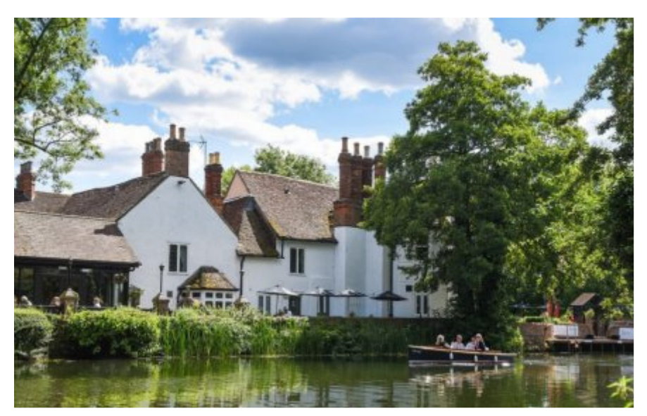
The Barns Hotel on the River Great Ouse