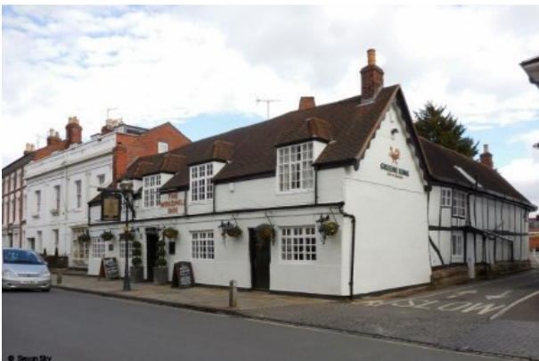
The Windmill Inn