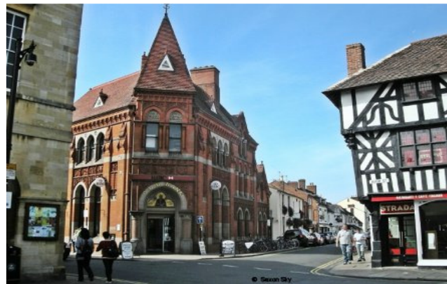
The Old Bank